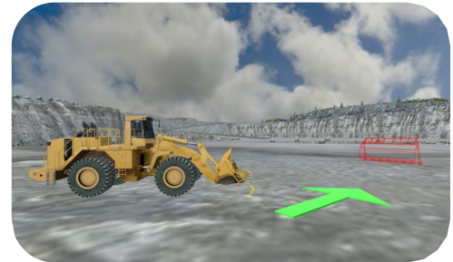
Positioning the bucket within a target