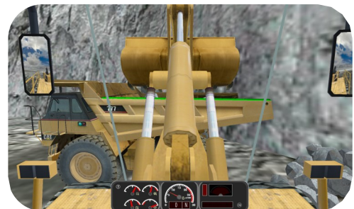
Loading an interactive Off-Highway Truck