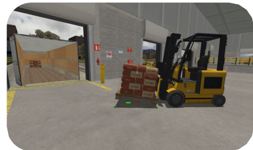
Placing loads into a box truck at the loading dock