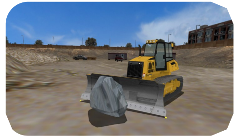
Using the blade to control the path of a boulder