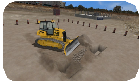
Using the blade to backfill a trench