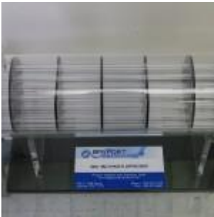
6020 Multi-Pass Floating Head