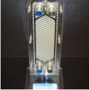
6030 Multi-port Plate Exchanger