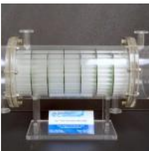
6023 Fixed Tube Sheet Single Pass