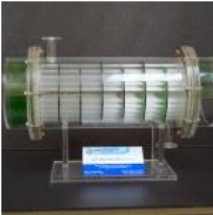
6021 Fixed Tube Sheet Multi-Pass