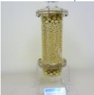
PRTM Platformer Reactor Training Model