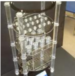
TRAY-2 Acrylic Distillation Training Trays

Operational features of these transparent acrylic training tools allow dismantling in your classroom, showing the participant the component parts, how they are assembled, how they look and gasket positioning. You can then reassemble the Heat Exchanger or allow the participant to complete the task for training purposes.