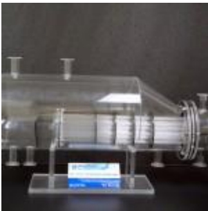
6022 Kettle Type Reboiler, Floating Head w/removable tube bundle