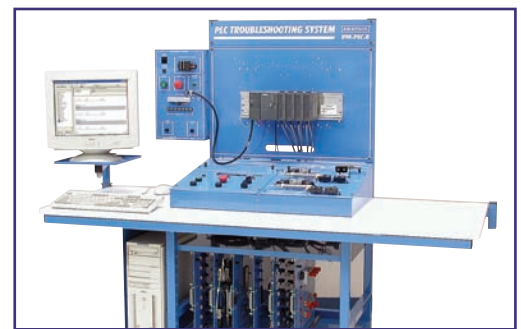
890-PEC-B PLC Troubleshooting Workstation shown with 890-S7300 Series

Amatrol's 890-S7312-B and 890-S7315-B Siemens PLC Modules add to Amatrol's 890-PEC-B PLC Troubleshooting Workstation to teach troubleshooting, programming and applications of Siemens' S7 PLC. The