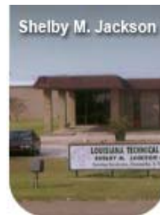
Shelby M. Jackson

All standards-based HealthCenter21 curriculum can be customized for a variety of class settings and includes a complete lab management software package called WebTRAC. WebTRAC is a server-based system that provides comprehensive tracking, reporting, assessment, and control of all aspects of the classroom, including student data and student work . This system allows curriculum to be delivered easily to any computer in the school.